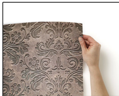
2. Apply the wallpaper adhesive to the wall and hang the canvas to the wall