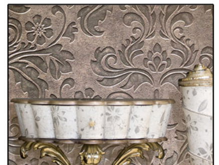
6. The result will be perfect if the installation is made carefully and correctly.