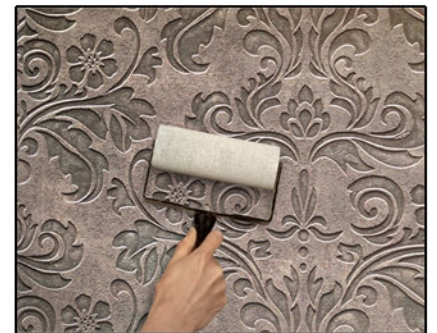
3. Carefully push any bubbles and wrinkles out toward the borders with a paint-roller