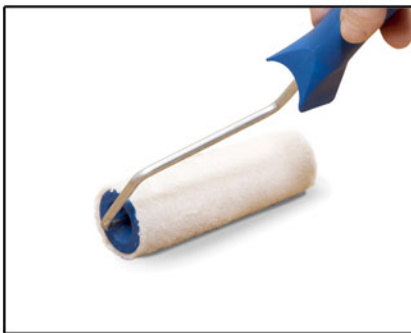
1. Apply the wallpaper adhesive to the back of the panel with a paint-roller and wait 3-7 min.

Adhesive for heavy non-woven wallpaper, plastic tub for the adhesive, paint-roller (for applying the adhesive to the wall and wallpaper), wide roller for wallpaper (to push out bubbles and wrinkles), narrow plastic roller (to smooth edges), sharp knife (to trim away excess).